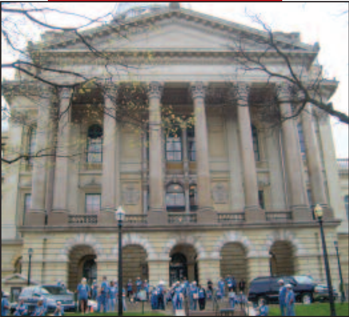
On Tuesday April 24, over 400 Local 21 stewards and activists rallied in Springfield in support of HB1500. Afterwards, they lobbied representatives in the Capitol, urging them to pass the bill to create state-wide video franchising.