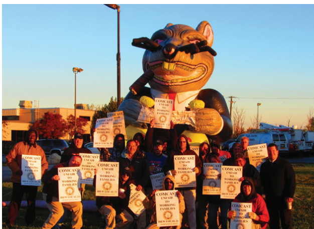
Comcast Members in Carol Stream hit the streets as contract negotiations drag on.

The keys to our success from today forward are preparation and unity. We may not like having to prepare for worst-case scenarios, but we must because our employers have been prepared for years. We must come together as one. Solidarity!