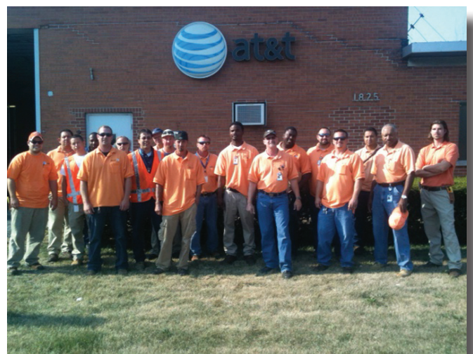
AT&T Gary Premise Techs stand in solidarity during AT&T bargaining.