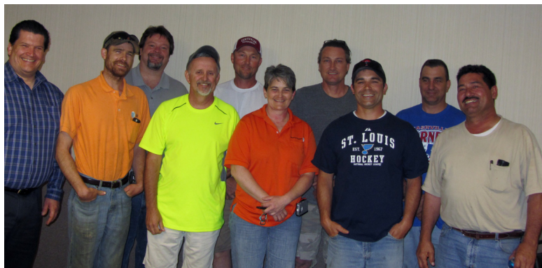
Our members in Unit 7 were all smiles at their meeting in Central City, IL.